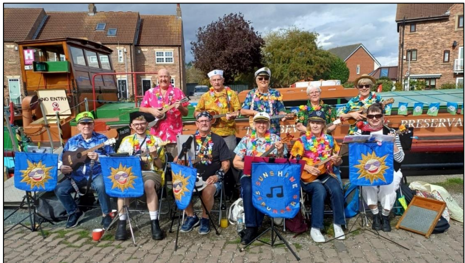
Sunshine Strummers down by the riverside at Beverley Barges Heritage Weekend