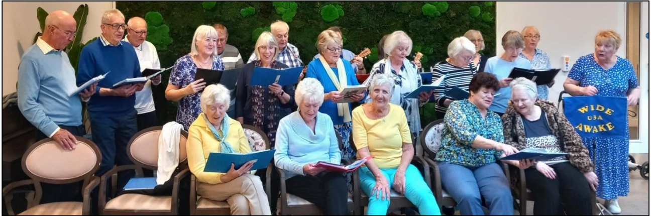
The Singing for Fun Group having fun singing at St. Mary's Residential Home on Chanterlands Avenue.

For more information, please follow the link below and send an email by clicking on the Leader's name: